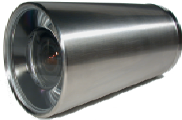
4,500 Meter Titanium Housing

This camera is small and ideal for applications that in the past required a SIT camera. The low light sensitivity approaches that of an EMCCD Camera, but at a much lower price.