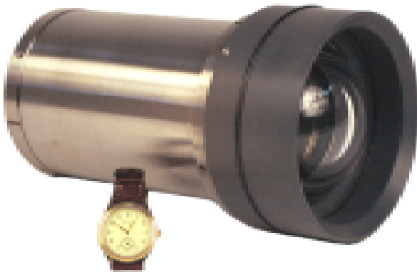
7,000 Meter Glass Hemispherical Dome Port Housing